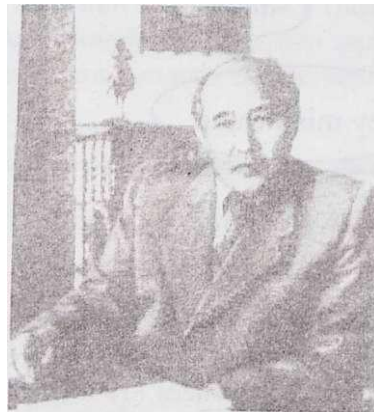
Mukhtar Auezov (1897-1961)

Атқарылған жұмыстың бір бөлігін ағылшын пәні мұғалімдерінің назарларына ұсынып отырмыз.