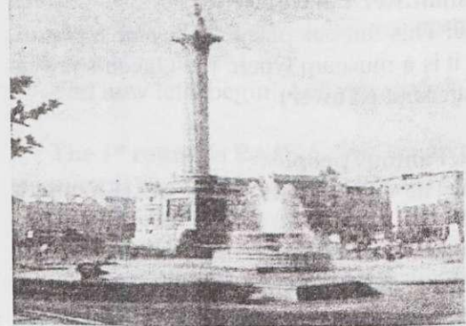
Admiral Nelson's monument