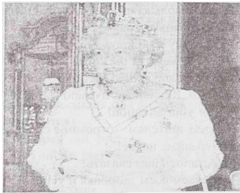
the Queen of the country Elizabeth II The